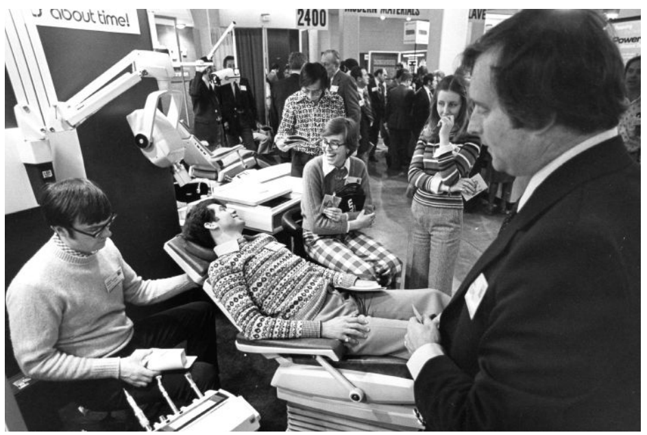
The Exhibit Hall for the 1976 Midwinter Meeting at the Chicago Hilton and Towers ballroom.

So, why isn't 2024 the 160th meeting? Keep reading!